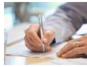
Low pay forcing techies to seek alternative careers