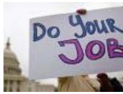
Senate seeks deal to avoid U.S. default as time runs short