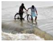
2 Odisha districts hit by floods after Cyclone Phailin; 2.5 lakh marooned