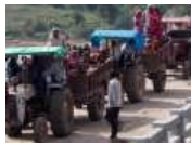
Temple stampede: Congress asks Madhya Pradesh CM to quit