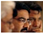
Coal scam: CBI names Kumar Mangalam Birla, former coal secretary in FIR