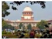
Co-operative societies don't fall within ambit of RTI Act: SC