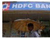
HDFC Bank quarterly profit growth slowest in a decade