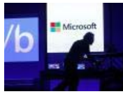
Eyeing phablets, Microsoft readies Windows Phone update