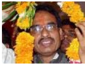
MP temple stampede: Government suspends Datia collector, police chief