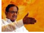
India may squeeze PSUs for cash as asset sales falter