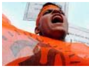
UP govt bans VHP's 'Sankalp Diwas' Yatra on Ram Temple issue